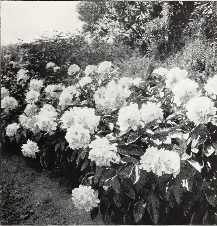
Festiva Maxima Peonies